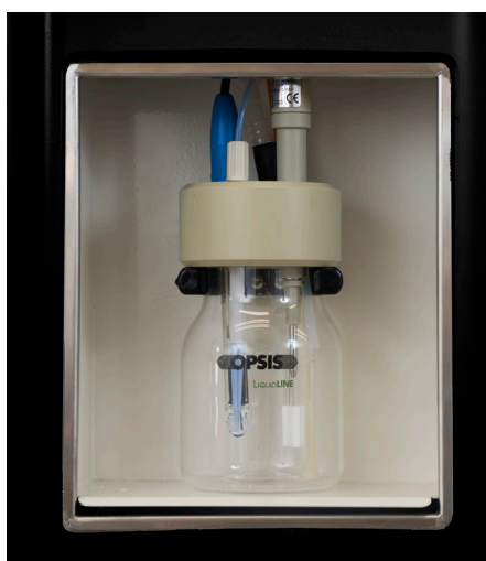
THE KJELROC DISTILLATION UNIT AUTO IS PROVIDED WITH A DEDICATED RECEIVER VESSEL, FOR EASIER USE TOGETHER WITH EXTERNAL TITRATORS

THE LABCONNECT SOFTWARE ALLOWS FOR EASY CONNECTIVITY TO YOUR LABORATORY