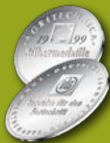
Silver Medal Innovation Award 1999 of the DLG (German Agricultural Society)

Innovation prizes such as the Eberle-Prize of the Federal State of Baden-Württemberg (1993) and the Silver Medal of the German Agricultural Society (DLG – 1999) give evidence on how successfully the high-tech potential of the TRIME ® -TDR-technology has distinguished itself in practice. Numerous industrial and scientific projects confirm the advantages of the TRIME ® -technology which by now has excellently performed under difficult conditions for 10 years at temperatures of up to 150°C and in application scenarios where other measuring systems failed to perform. You can find further information regarding the benefits of the TRIME ® -TDR, in comparison to moisture measurements conducted on the basis of conventional capacitive methods or microwave technology, on our homepage www.imko.de under the topic „About TRIME-TDR“.