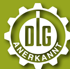
certified by the DLG (German Agricultural Society)