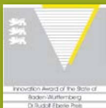
Innovation Award of the State of Baden-Württemberg