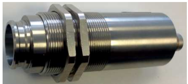
Sirius pyrometer's rugged stainless steel housing

Lenses: The infrared energy radiated by the target is collimated directly onto the detector via the lens and is digitally processed to provide optimum performance. Choose from the lens selection chart below for exact focus distance and spot size to meet the target size requirement. Lenses are made of an optical glass which is highly transparent in the spectral region of this model. If additional windows are necessary, they must offer similar optical characteristics.